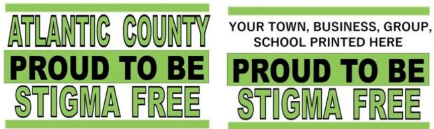
Sample Lawns Signs/Posters

The following images are examples of promotional materials that your collaborative may want to order from your local printer. The Stigma Free Atlantic Collaborative may have a limited number of materials. For more information contact: StigmaFreeAtlantic@mhanj.org