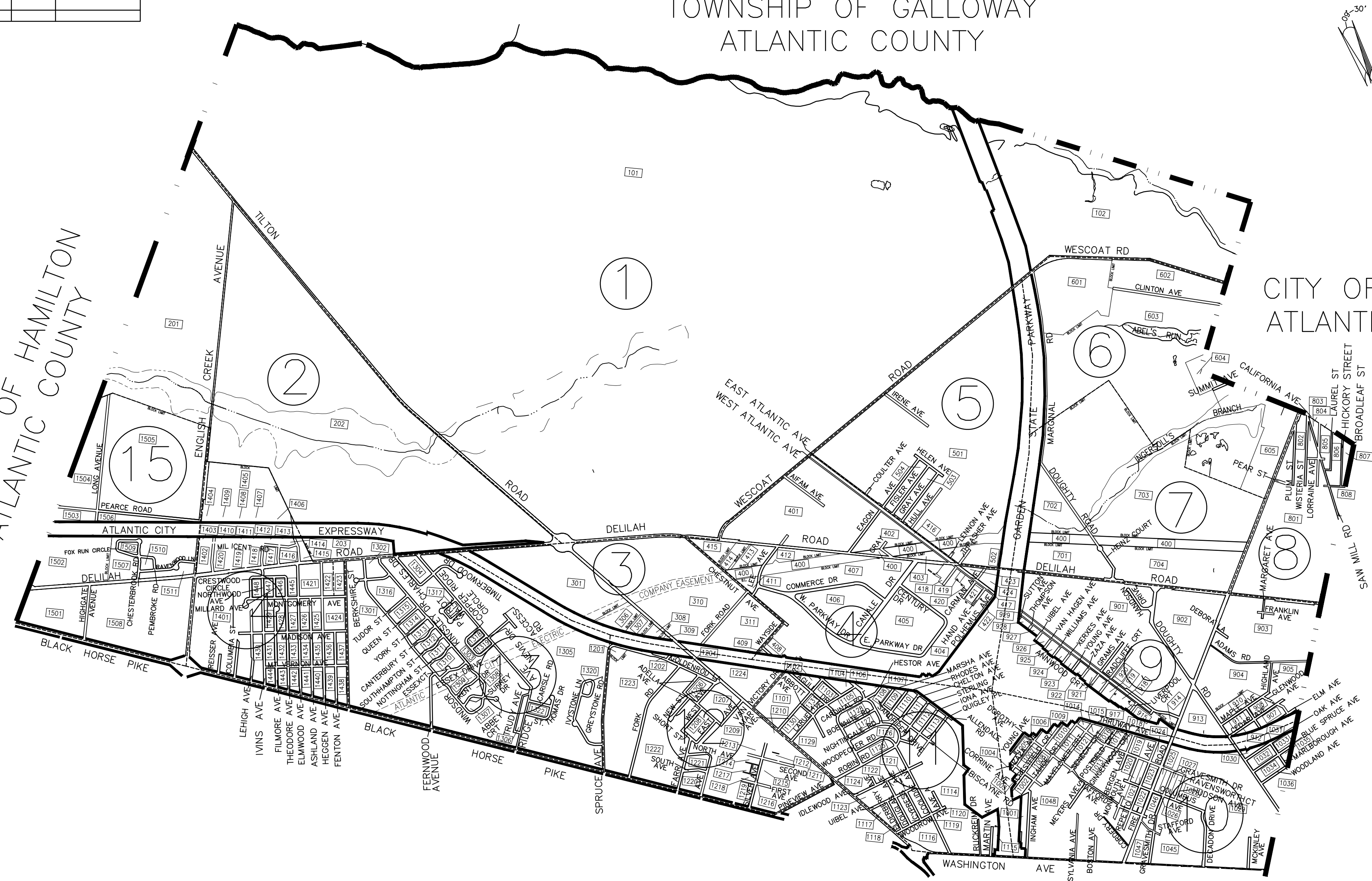
KEY MAP II