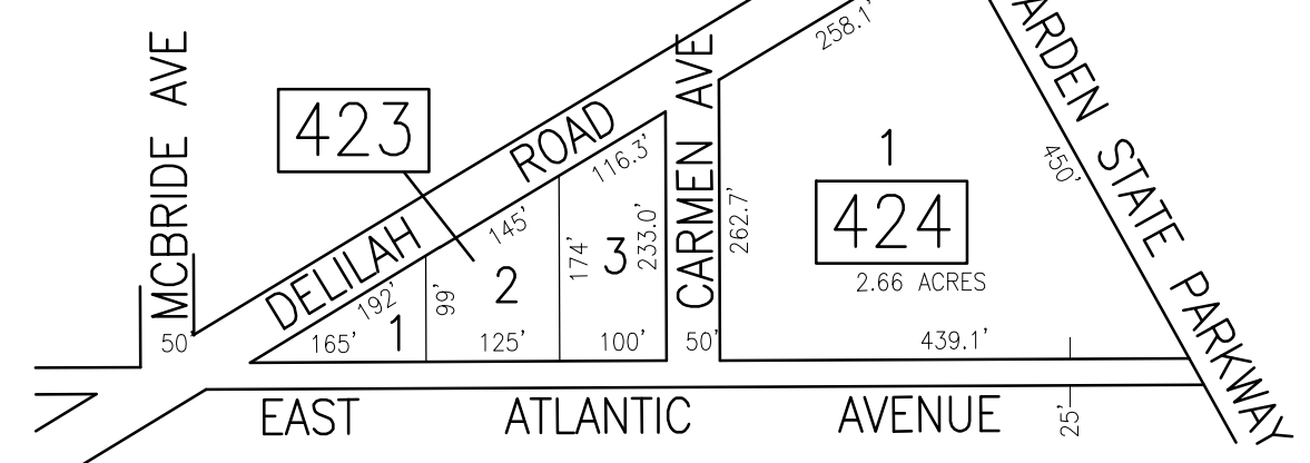
INSET SCALE: 1"=200'

THIS SHEET HAS BEEN DRAWN USING COMPUTER AIDED DRAFTING/DESIGN (CAD/D).